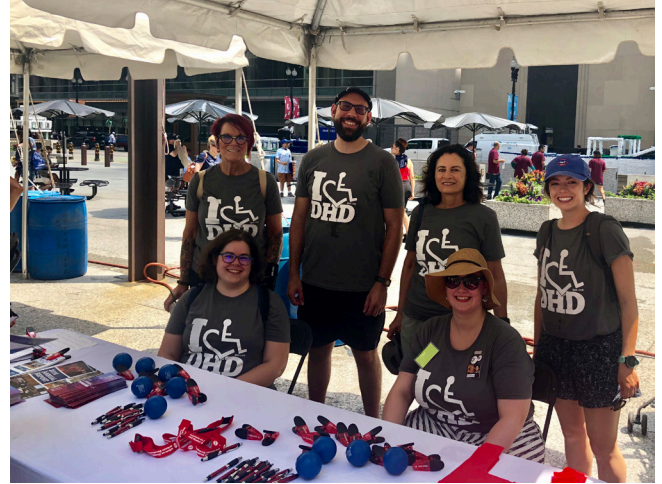
DHD volunteers are pictured at the DHD booth at the Disability Pride Parade 2019.