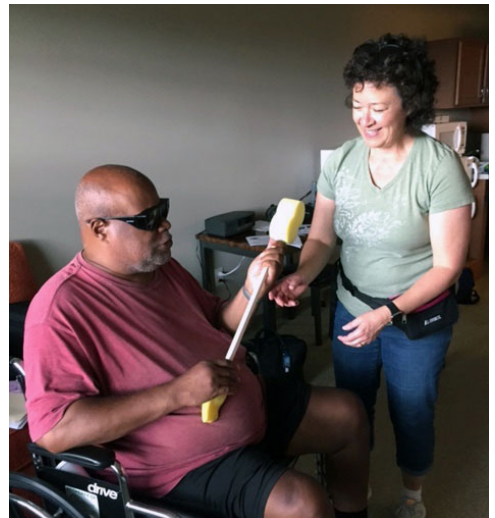
ATU occupational therapist checks daily living equipment.