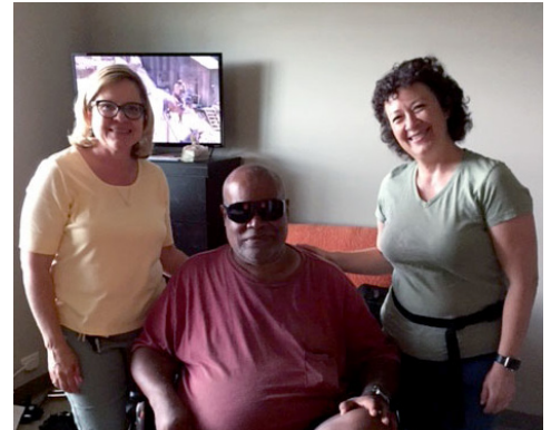
ATU occupational therapists visit a Colbert class member's home.

Anyone interested in ATU services is encouraged to contact ATU Case Management at 312-413-9065 or atu@uic.edu .