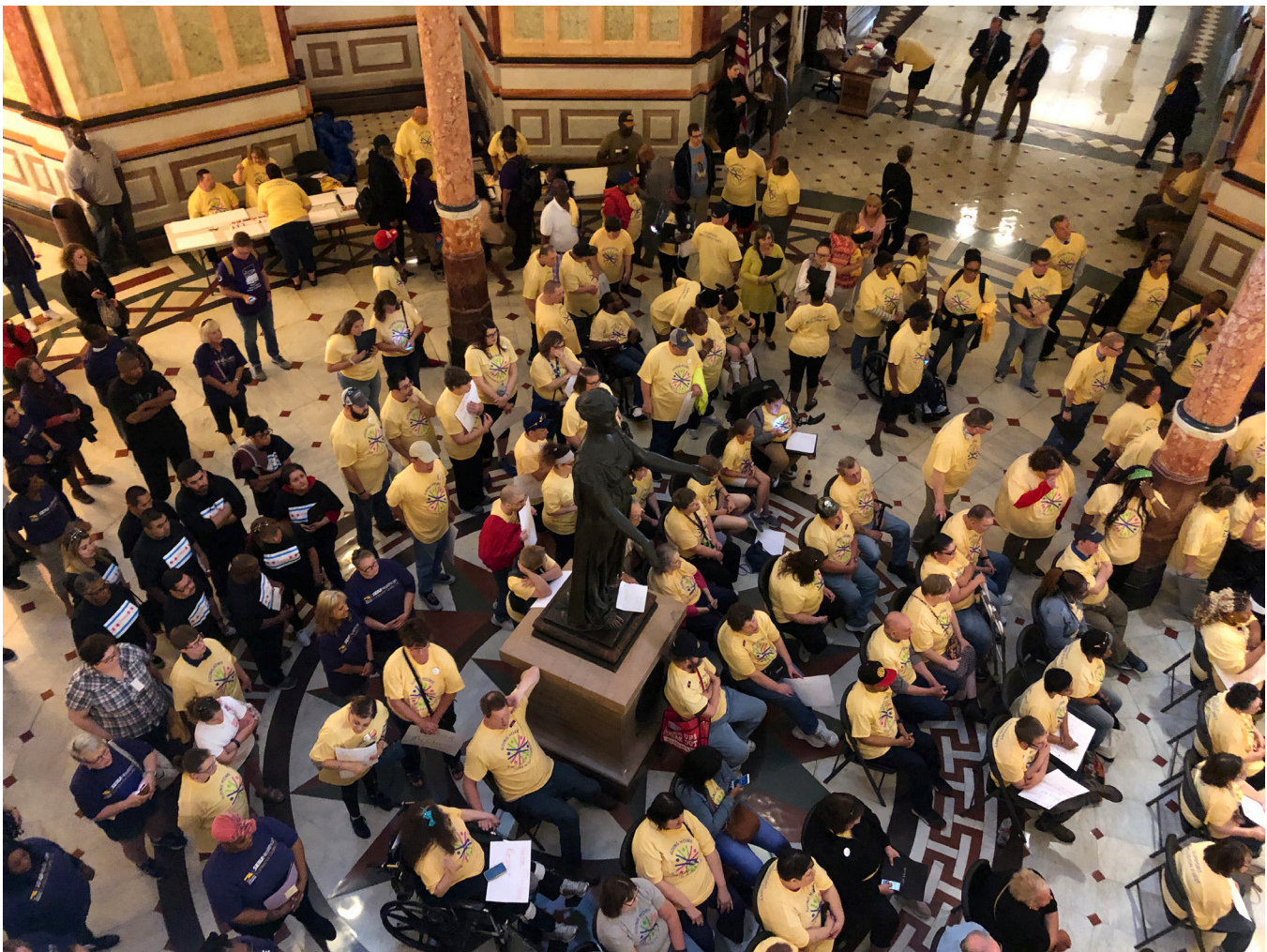
Going Home Advocacy Day 2019 attendees listen to presentations in the Illinois Capitol Building Rotunda.